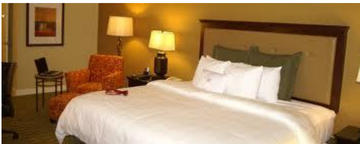
One of the rooms at the Crowne Plaza (maybe yours?)

President Zorn has a block of rooms reserved at the Stoddert Reunion group rate of $90 per night for a Standard sunset-view room (2 double, a queen, or king beds), $100 per for the Standard river-view rooms, and River-view Junior Suites for $140 per night. Hotel reservations should be made by calling 904.398.8800. Be sure to ask for the Benjamin Stoddert discount! The hotel staff advised to NOT call the 1-877 reservation number, but to call direct to the hotel to ensure your discount. The cancellation policy requires notifying the hotel by 6 pm 3 days prior to your reservation to cancel or change. Failure to cancel in time can cost one night’s rate.