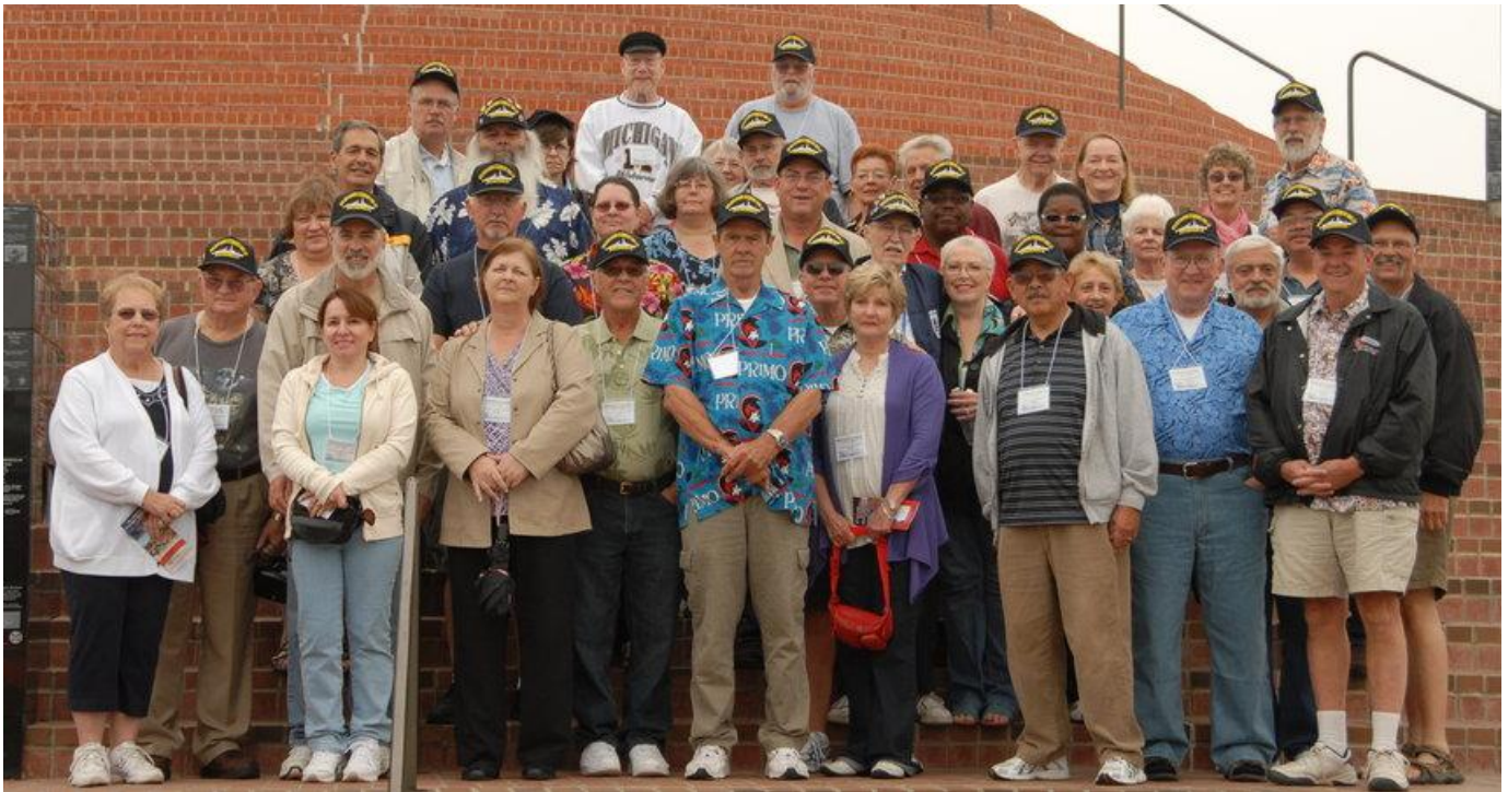
This was most of the tour group—taken at the Military Memorial at Cabrillo Park