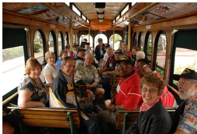
Trolley Tour #1, ready to depart.