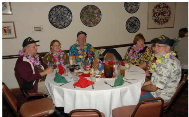
One of the tables at the Luau, a seated dinner.